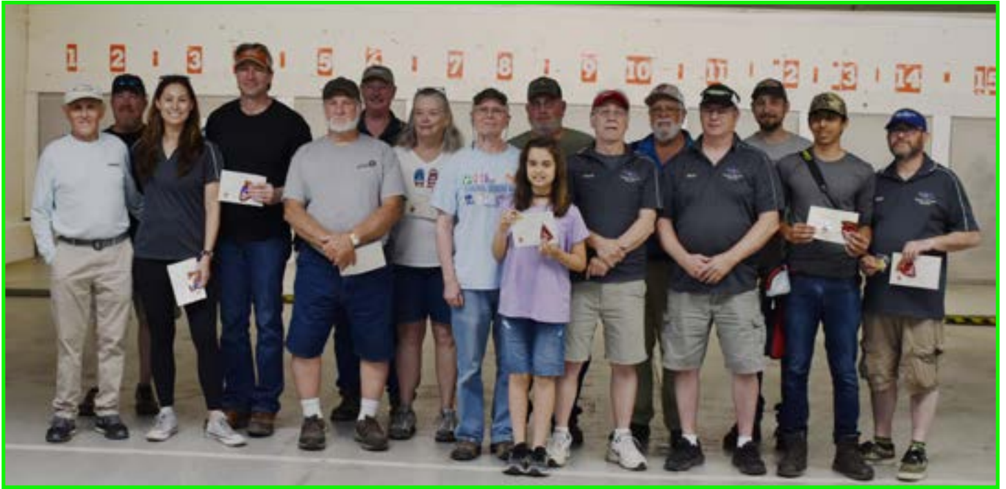
2023 VBA State Open Winners