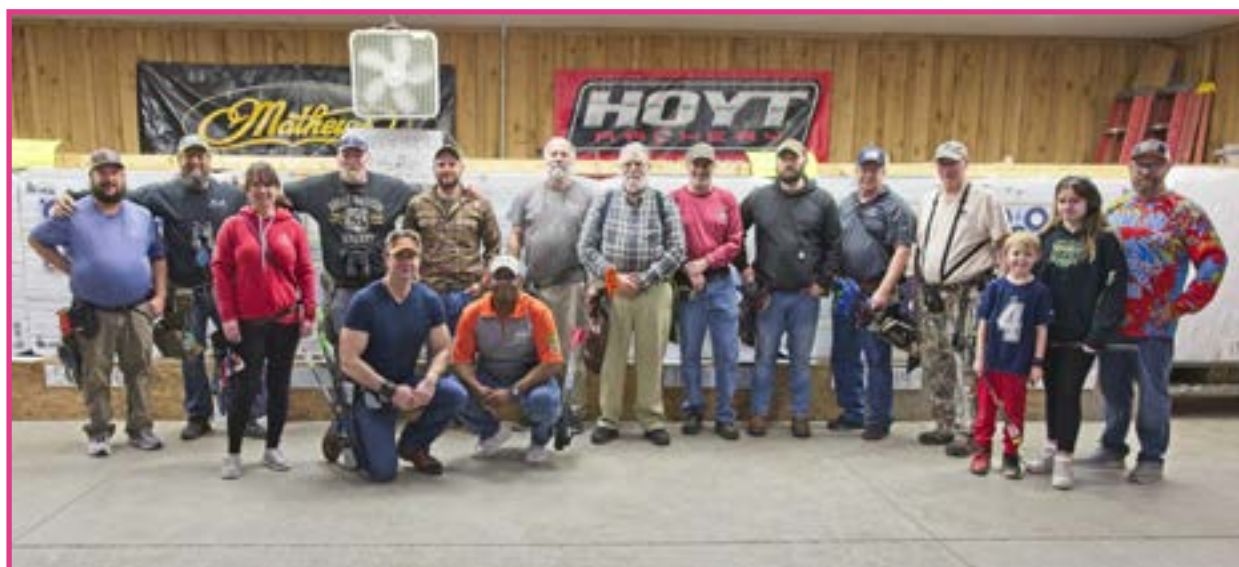
2023 VBA State Indoor Winners